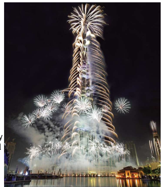
NEW YEAR'S CELEBRATIONS

Thank you for your cooperation and wish you a happy new year.