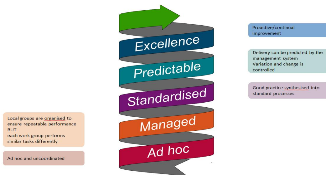
Figure 2-2 – RM3 Criteria – Maturity levels

For each RM3 Sector Criteria, five (5) Maturity Levels have also been identified. The Maturity Levels ranging from Excellence down through to Ad-hoc, are shown in Figure 3. Detailed descriptions of the Maturity Level requirements are shown in Section 4.