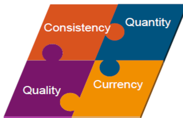
Figure 3-2 – Evidence Factors

Inspectors should use their judgement when deciding which criteria and evidence to use. The following issues should be considered: