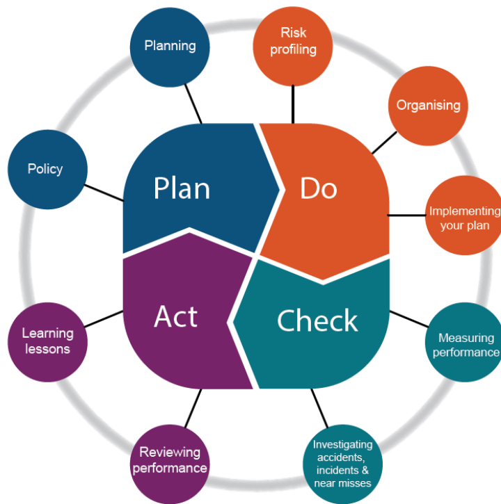
Figure 1-1 – The 'Good Practice' Process for Health and Safety Management

The SRA has adopted the RM3 process, including the defined five (5) Organisation H&S Performance Sectors, twenty-six (26) Sector Criteria with the five (5) associated Maturity Levels. These have been subjected to minor changes from the source ORR document to reflect the laws and particular characteristics of the railway systems in Dubai.