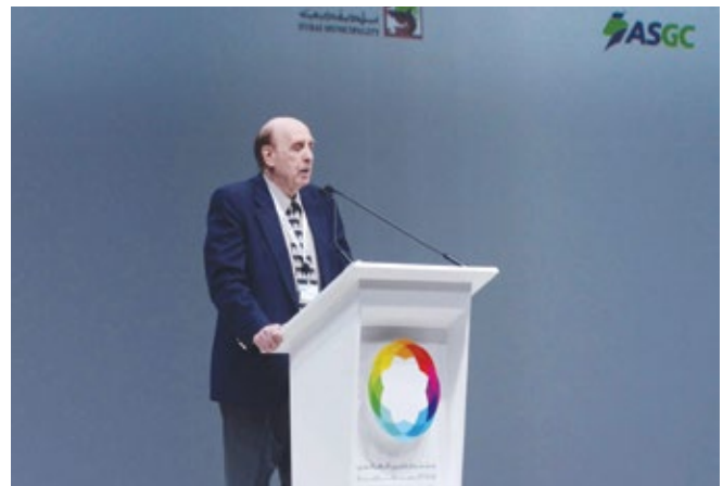
مستقبل إدارة المشاريع.