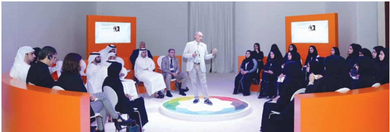
«مسيار الأمل» وتقليل البصمة الكربونية.

ident and Prime Minister of the UAE and Ruler of Dubai that science is innovation not iteration.