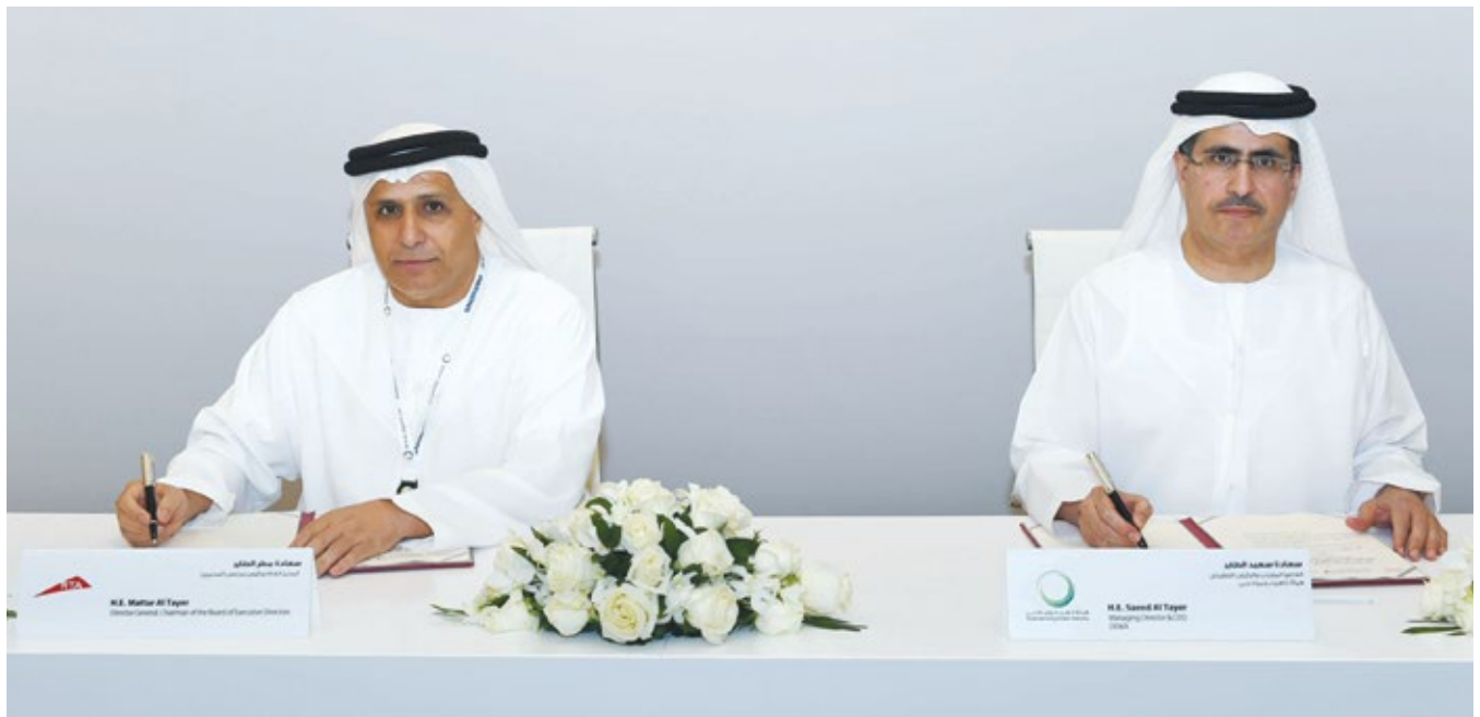
Al Tayer and Saeed Al Tayer sign MoU

this Forum for future projects such as Expo ,2020 which is expected to attract 25 million visitors, 70% of them will come from outside the UAE, and set to create more than 277,000 jobs.